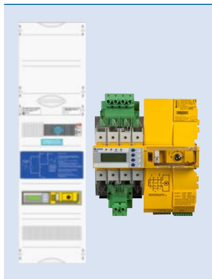
UMA710-2-xx-DIO-BP (example illustration)